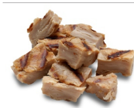
High Moisture Meat Analogue