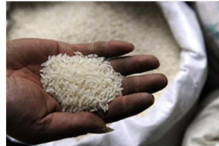
Fortified Rice Kernel