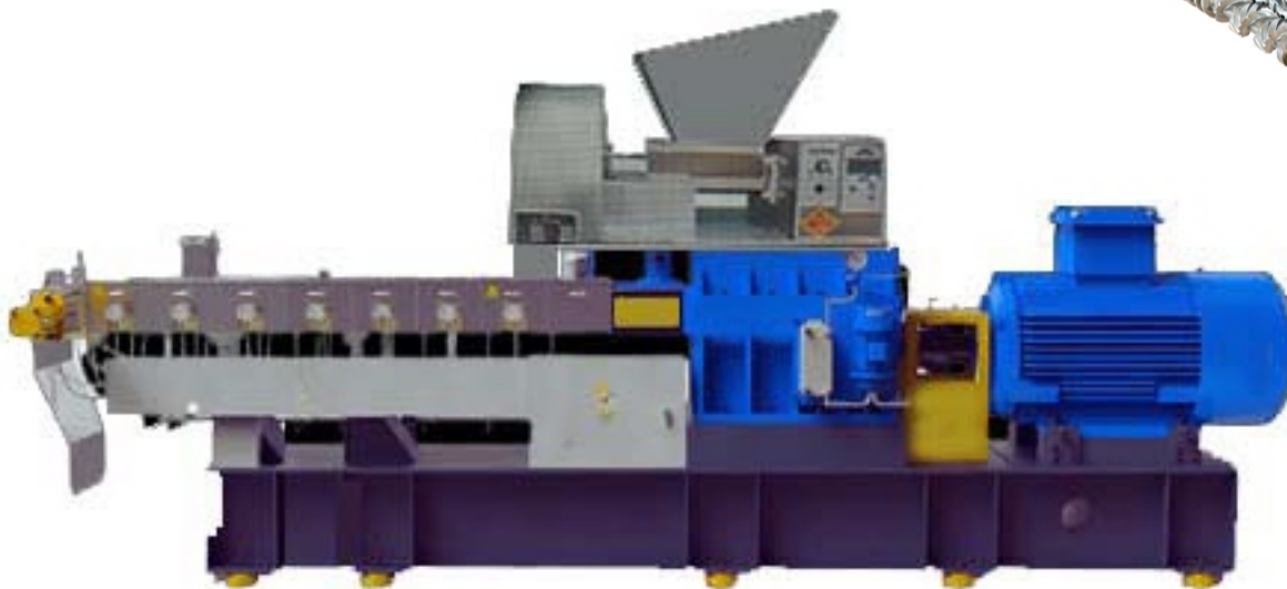
MEGA-70 For Food