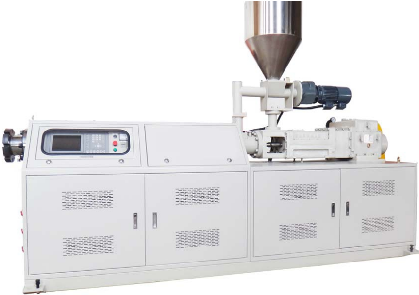
MEGA(PVC)-65 model for Plastics